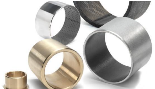
Ferrous and Non Ferrous Bushes