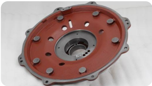
Brackets and Flanges