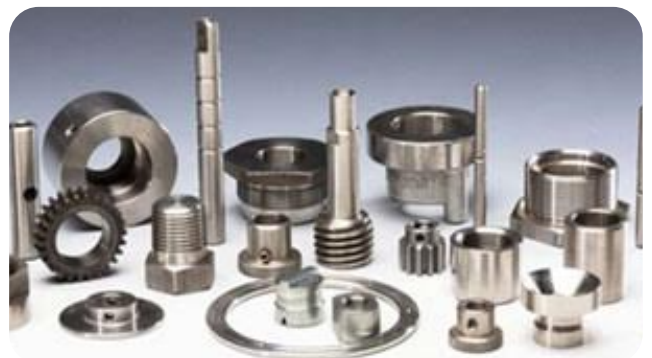
CNC Machine Components