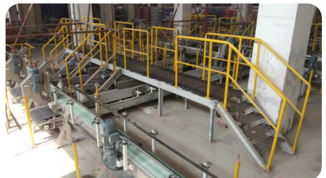
Ladder, Railway & Walkway